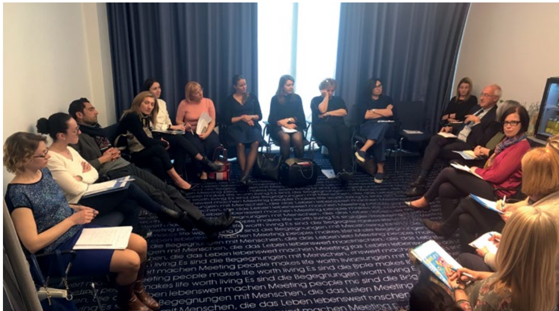
Side event during Roundtable 40: Learning from Increase Programme towards the Programme of National Support

A side event focusing on “Learning from the Increase Programme: Towards the Programme of National Support” took place in Berlin one day prior to the 40th Roundtable. GENE partners from Cyprus, Latvia, Malta, Slovakia and Slovenia that participated in the GENE Increase Programme 2016-2018 were invited to share experiences and reflect on lessons learned. Participants discussed the usefulness of mapping Global Education, as illustrated by the experiences of Slovakia, Slovenia and Malta. They also discussed challenges they face, such as the high turnover of people responsible for Global Education, a lack of or limited institutional memory and limited structural support for Global Education.