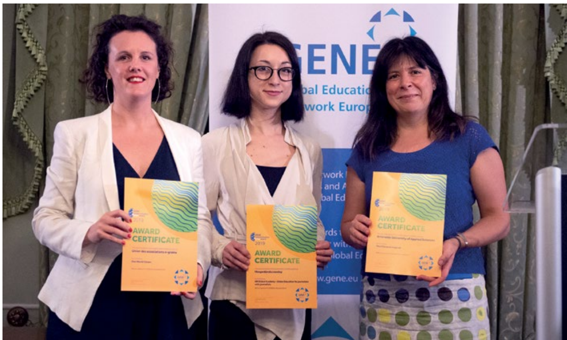
2019 Global Education Ideas Award winners at GENE Roundtable 41, Valletta, October 2019

The 2019 GENE Global Education Ideas Award Brochure was compiled, designed and printed. It described the whole process of the GENE Global Education Ideas Award and included short descriptions of the three awarded initiatives. The 2019 Brochure also included testimonies from all the members of the International Selection Committee. In addition, the 2017 and 2018 GENE Global Education Innovation Award Brochures were translated into Korean language by Korea International Co-operation Agency.