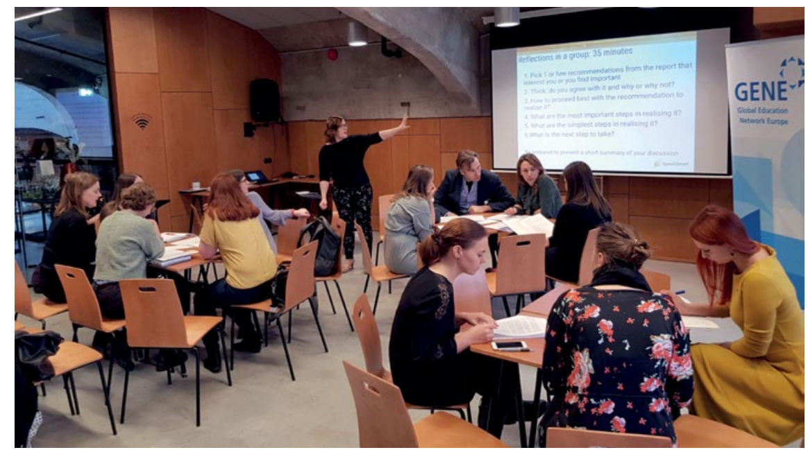
Peer Review Launch in Estonia