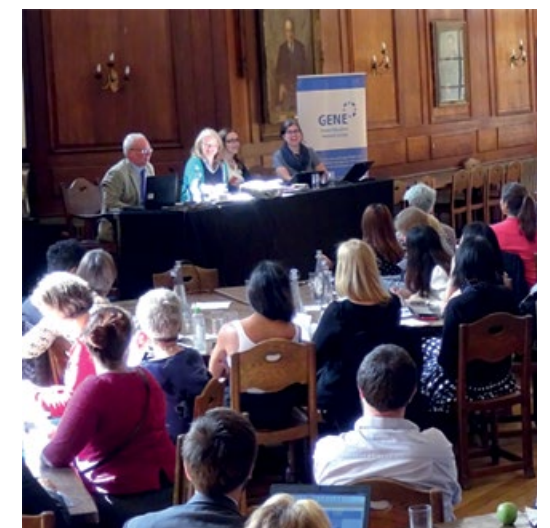
Angel Conference in London May 2019