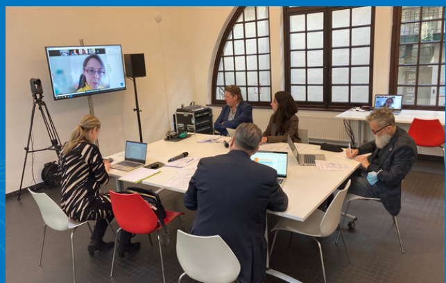
GENE consulting stakeholders regarding elements of the new European Declaration on Global Education to 2050.