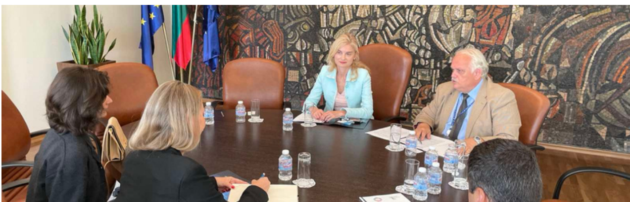
GENE Capital Visit to Bulgaria, September 2021.