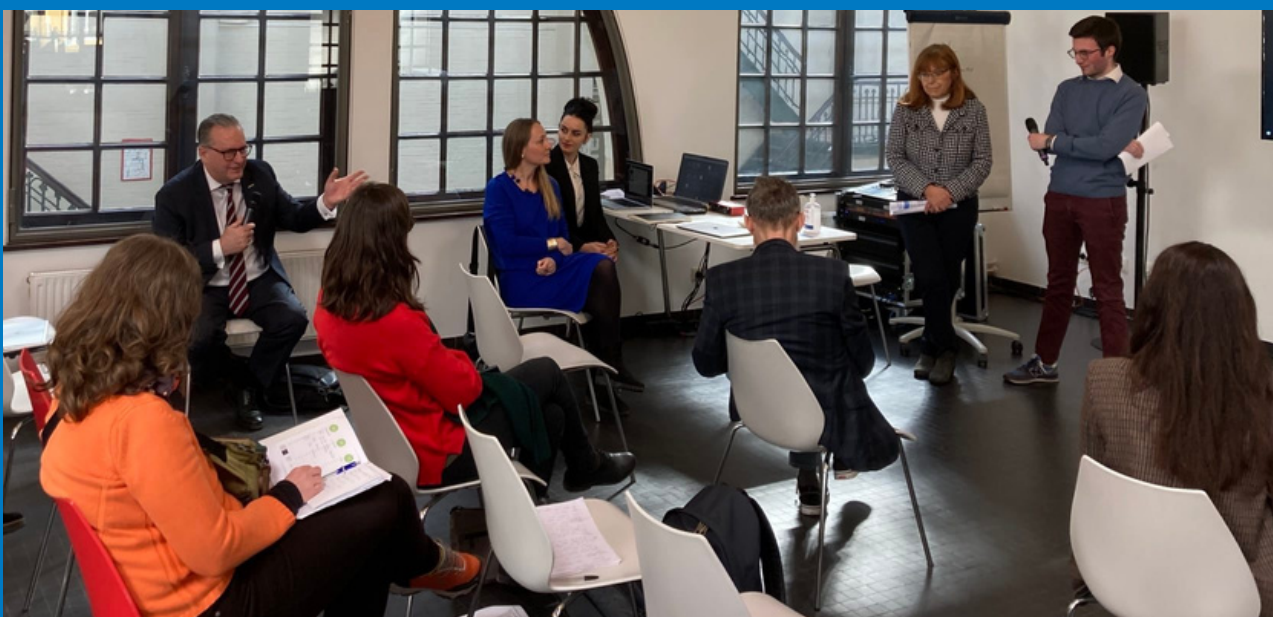
GENE consulting stakeholders regarding elements of the new European Declaration on Global Education to 2050.